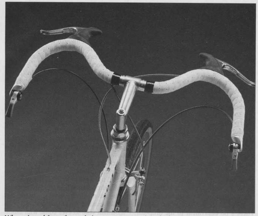
When viewed from the cockpit, you can appreciate the hand gymnastics necessary to captain the XO-1.

bike's retail price. It's a cast, semi-sloping crown originally designed for a Japanese touring bike. Even with suffi-