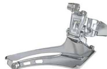
FDR90 BB/LB/MB [56~50T Double] [Forged Alloy Links]