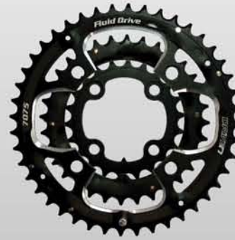
CRMX0.44 [44T,w/CNC] CRMX0.32 [32T] CRMX0.22 [22T]

Front Derailleur Clamp [Forged Alloy] [ø34.9, ø31.8, ø28.6mm Option]