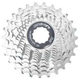
CSRZ5* TAO 11-23T TBQ 12-25T TBR 12-27T