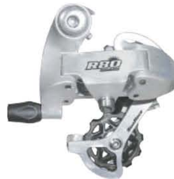
RDR86 SD/LD [8-Speed]