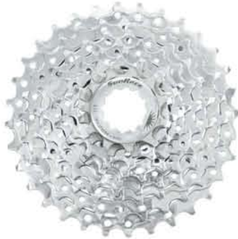
CSM9S 9AU 11-32T U[UCP] [Light Weight Design]