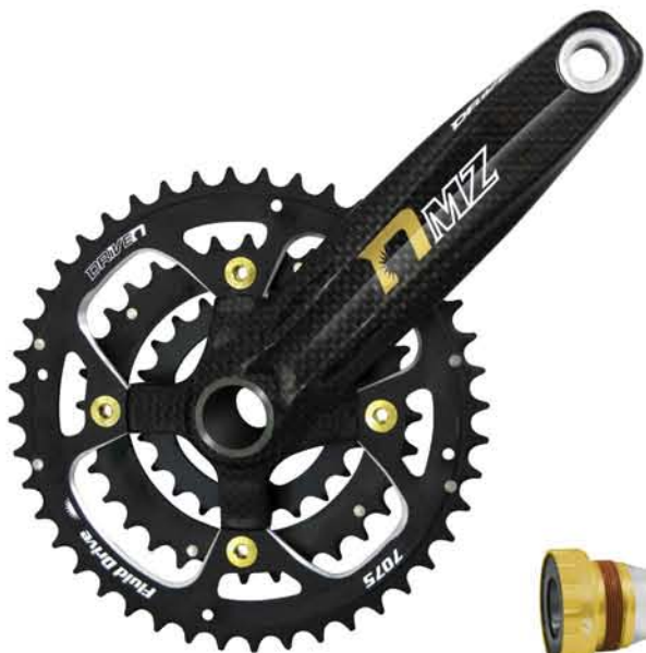
FCMZ7 (D1) 44-32-22T [Carbon Reinforced Crank] [Titanium Axle] [7075 Chainrings] [7075 Bolts & Nuts] [7075 Axle Bolt] [818g incl. BB]