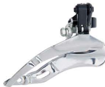
FDM2A SB/ST/MB/MT [48-38-28T] [Heat Treated Chainguide]