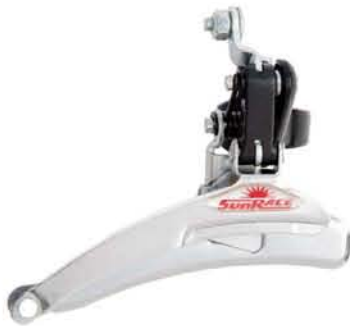
FDM06 SB [Double]