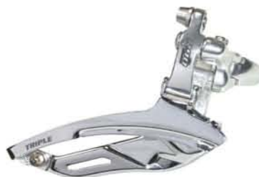
FDR99 BB/LB/MB [50T] [Triple] [Forged Alloy Links]