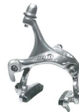
BCR90 F/R [Quick-Release] [Forged Alloy Caliper] [Cartridge Brake Shoe Pads]