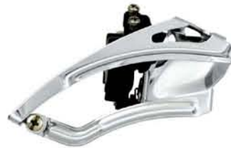
FDM97 LD/MD/SD [44-32-22T or 48-36-26T] [Alloy Body] [Dual Pull]