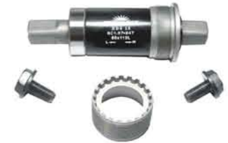
BBS15 BSB/BSA/BSF [BC-68/(107mm FCR81/83) /(103mm FCR86) /(111mm FCR87)]