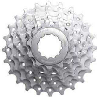
CSR86 8AO 11-23T 8BQ 12-25T CSR63 7AP 11-24T 7BP 12-24T S[Satin] [Light Weight Design]