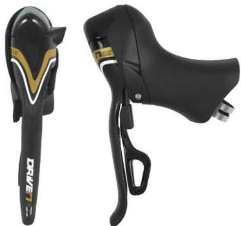
STRZ RT/L2 [Carbon Reinforced Brake Lever] [7075 Forged Alloy Up-Shift Lever] [Teflon Coated Cable] [383g/pair]