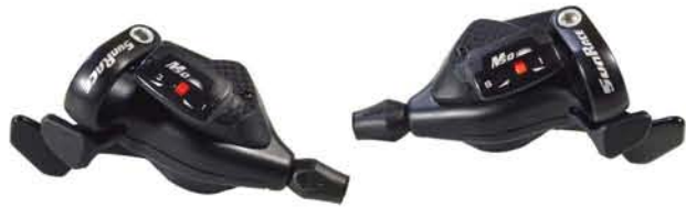
DLM53 R8/R7/L3 [Alloy Up-Shift Lever]