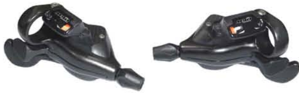
DLM90 R9/L3 [Composite Shift Levers]