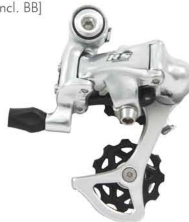
RDRS SD [7075 Bracket Bolt] [Alloy Links] [Alloy Cage] [10 & 9-Speed] [195g]