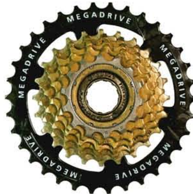
MFM2A 7DV 14-34T 3[UCP+Black Combination] 2[Brown+Black Combination] [Locking Design]