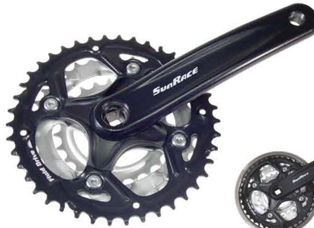
FCM52 42-34-24T [Alloy I-Crank]