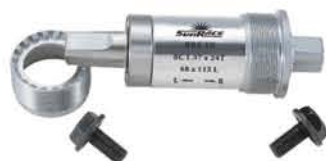
BBS18 BSA/BSF [BC-68/(103mm FCR9F)/(111mm FCR9A)]