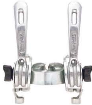
SLR03 FF/RF Clamp:(H) 22.2mm (D)28.6mm