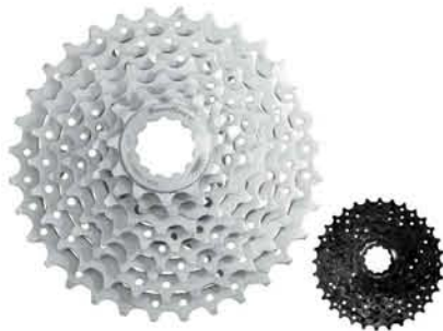
CSM66 8AV 11-34T* 8AU 11-32T* 8AS 11-28T* 8BV 12-34T 8BU 12-32T