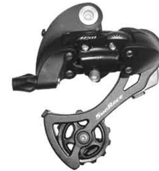
RDM56 LD [Alloy Outer Link] [13T Tension Pulley]