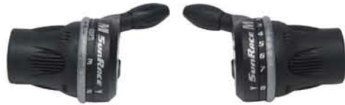
TSM63 R8/R7/L3/LF [Force Adjuster] [Alloy C-Clamp]