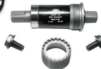
BBS15 BSU [BC-68/127mm]