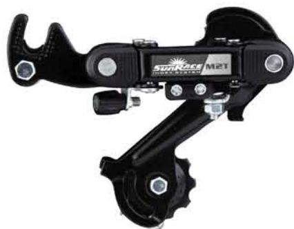
RDM2T LD/LB SD/SB [7 & 6-Speed] [Index Cable Adj.]