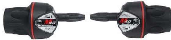
TSM45 R7/L3 [Cyclop Display] [Alloy C-Clamp]