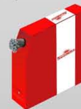
ICRRG - Regular Galvanized Ø1.6mm [Road Brake Cable]