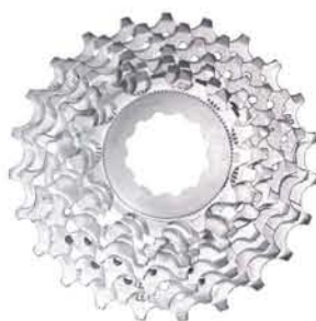
CSR96 9AQ 11-25T 9BQ 12-25T S[Satin] [Light Weight Design]