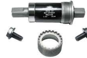
BBS15 BSG [BC-68/113mm]