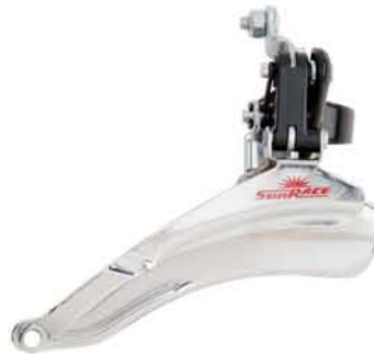
FDM05 SB/MB [48-38-28T] [Friction]