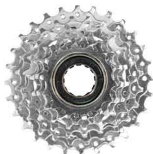
MFM20 6DS 14-28T U[UCP] [Light Weight Design]