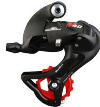
RDM4S XD/XB [Mega 15T Tension Pulley] [Index Cable Adj.]