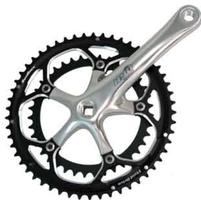
FCR9F 50-34T FCR9A 53-39T [Alloy Chainrings] [SCM435 Bolts & Nuts] [6061 Forged Alloy Crank]