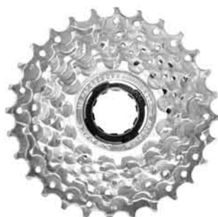
MFM3S 7CS 13-28T U[UCP] [Lockring Design] [Light Weight Design]