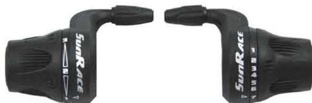
TSM28 R7/R6/R5/LF/L3 [Cable Adjuster] [Light Action Shift - Dual Ways] [TPR Grip]