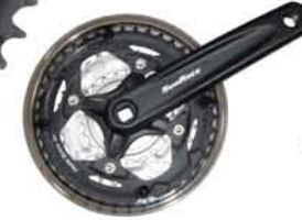
[M] BBS15 BSK [BC-68/119mm]