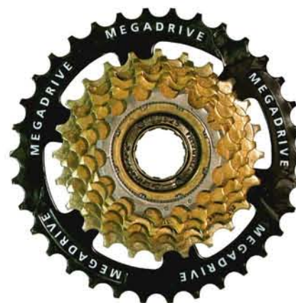
MFM2A 7DV 14-34T 3[UCP+Black Combination] 2[Brown+Black Combination] [Lockring Design]