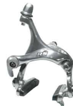
BCRS F/R [Quick-Release] [Forged Alloy Caliper] [Cartridge Brake Shoe Pads] [Convex Washer Adj. Shoes] [184g]