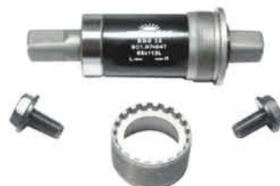
BBS15 BSA/BSF [BC-68/(103mm FCR96)/(111mm FCR91)]