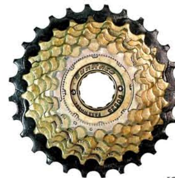
MFM2A 7DS 14-28T 6DS 14-28T 5DS 14-28T 1[UCP+Black Combination] 2[Brown+Black Combination] [Lockring Design]