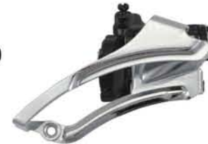
FDM56 LD/MD/SD [42-34-24T] [Alloy-Steel Clamp] [Dual Pull]