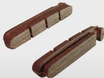
BPRZ1 [For Carbon Rim]