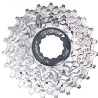
CSRX TAO 11-23T TAQ 11-25T TBQ 12-25T TBR 12-27T S[Satin] [6061 Lockring] [6061 Spacer]