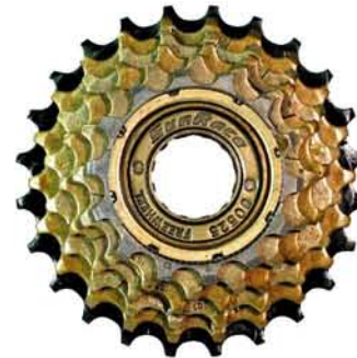
MFR2A 6DP 14-24T 2[Brown+Black Combination]