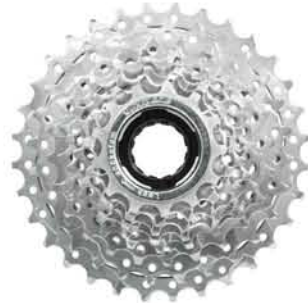
MFM60 8CV 13-34T 8CU 13-32T 8CS 13-28T U[UCP]/C[CP]