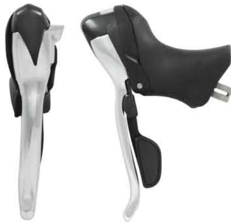
STRS RT/L2 [Forged Alloy Brake Lever] [Rubber Cushioned Up-Shift Lever] [Teflon Coated Cable] [418g]