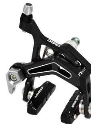
BCRX F/R [Quick-Release] [CNC Alloy Caliper] [Cartridge Brake Shoe Pads] [Convex Washer Adj. Shoes] [325g/pair]