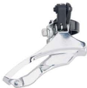
FDM2S SB/ST/MB/MT [42-34-24T] [Heat Treated Chainguide]