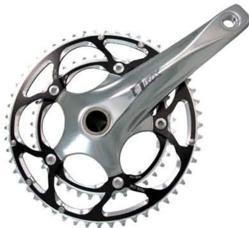
FCRX6 [D1] 50-34T FCRX1 [D1] 53-39T X7 [D1] 50-36T X3 [D1] 52-39T [BCD 110mm] [BCD 130mm] [6061 Forged Alloy Crank] [Chromoly ISIS Axle] [7075 Chainrings] [7075 Bolts & Nuts] [7075 Axle Bolt] [939~959g incl. BB]