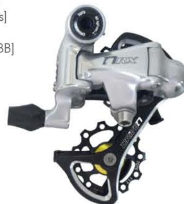
RDRX SD [Alloy Links & Cage] [7075 Pulleys] [Sealed Cartridge Bearings] [7075 Bracket Bolt] [10 & 9-Speed] [198g]