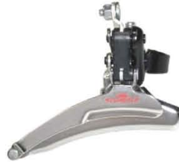
FDM06 SB [Double] [Friction]