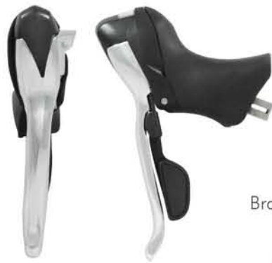
STR80 R8/LL [Forged Alloy Brake Levers] [Rubber Cushioned Up-Shift Lever] [418g/pair]