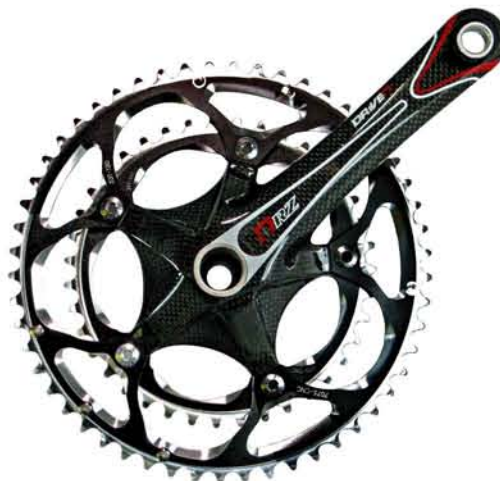
FCRZ6 [D1] 50-34T FCRZ1 [D1] 53-39T Z7 [D1] 50-36T Z3 [D1] 52-39T [BCD 110mm] [BCD 130mm] [Carbon Crank] [Titanium Axle] [7075 Chainrings] [7075 Bolts & Nuts] [7075 Axle Bolt] [702~722g incl. BB]