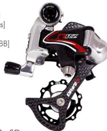
RDRZ1 SD [Carbon Reinforced Link] [Carbon Cage] [Carbon Cable Adj.] [7075 Pulleys] [Sealed Cartridge Bearings] [7075 Bracket Bolt] [10 & 9-Speed] [187g]