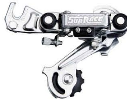
RDM10 LD/LB [Friction]