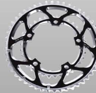
CRRX0.53 [53T] CRRX0.52 [52T] CRRX0.39 [39T] CRRX0.50 [50T] CRRX0.34 [34T] CRRX1.50 [50T] CRRX1.36 [36T]

Chainrings Combinations [7075 Alloy/CNC]