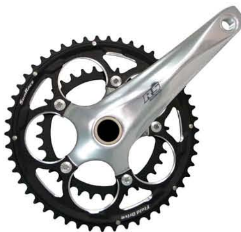
FCRS6 (S1) 50-34T FCRS1 (S1) 53-39T [BCD 110mm] [BCD 130mm] [6061 Forged Alloy Crank] [Alloy Chainrings] [7075 Bolts & Nuts] [7075 Axle Bolt] [937g/939g incl. BB]