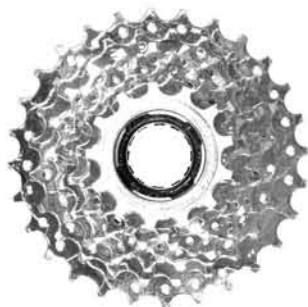
MFM30 7CS 13-28T C[CP] [Lockring Design] [Light Weight Design]