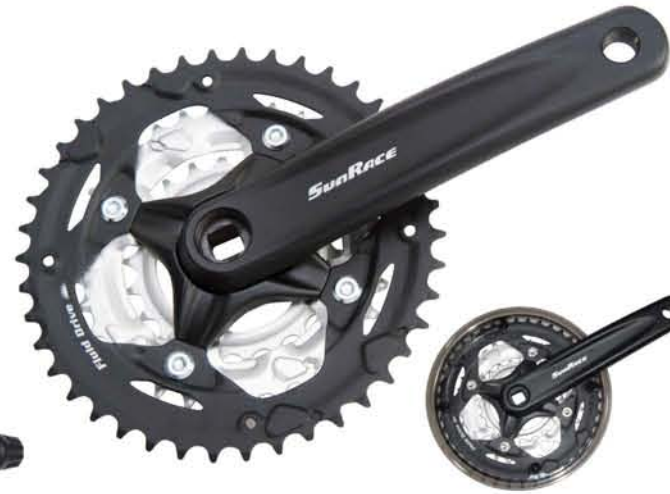
FCM63 42-32-22T [Alloy I-Crank]