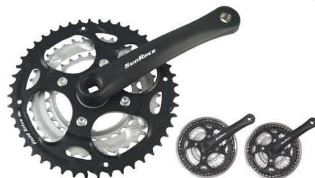
FCM31 48-38-28T [Alloy A-Crank]