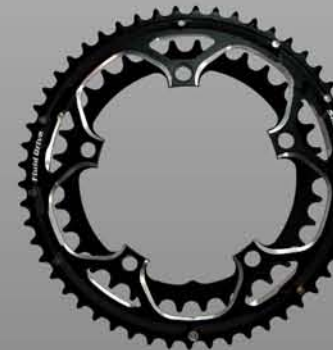
CRRS0.53 [53T,w/CNC] CRRS0.39 [39T] CRRS0.50 [50T,w/CNC] CRRS0.34 [34T]

Chainrings Combinations [7075 Alloy/CNC]