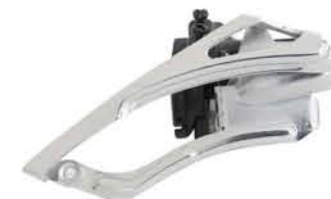
FDM34 LD/MD/SD [48-38-28T] [Alloy-Steel Clamp] [Dual Pull]