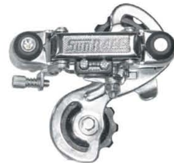
RDM10 SD/SB [Friction]