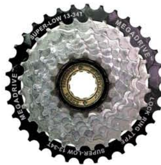
MFM56 8CV 13-34T U[UCP] [Lockring Design]