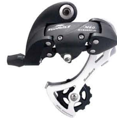
RDM63 LD [Magnesium Outer Link] [Alloy Outer Cage] [13T Tension Pulley]