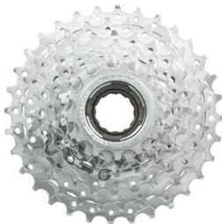
MFM90 9CU 13-32T U[UCP]/C[CP] MFE90 9CU 13-32T C[CP] [Lockring Design] [Light Weight Design]