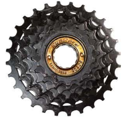
MFM05 7DS 14-28T 6DS 14-28T 5DS 14-28T [Friction]