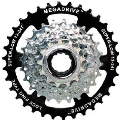
MFM4S 7CV 13-34T U[UCP+Black Combination] [Locking Design] [Light Weight Design]