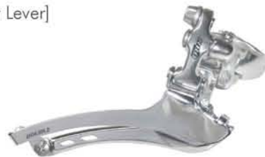
FDR80 BB/MB/SB [56~50T Double] [Forged Alloy Links]