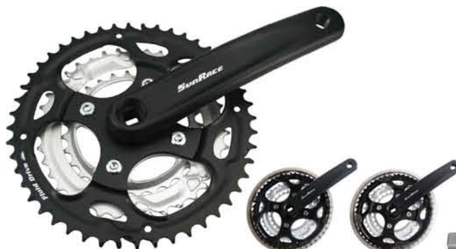
FCM33 48-38-28T [Alloy I-Crank]