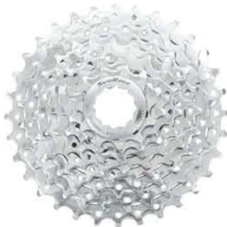
CSM56 8AU 11-32T U[UCP] [Light Weight Design]