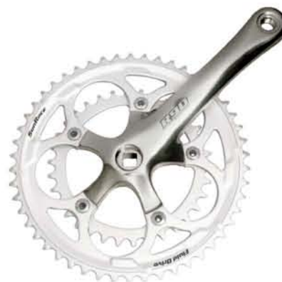
FCR96 50-34T FCR91 53-39T [SCM435 Bolts & Nuts] [6061 Forged Alloy Crank]