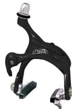
BCR91 F/R [Quick-Release] [Alloy Caliper] [Cartridge Brake Shoe Pads]