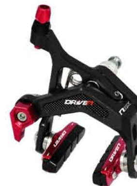
BCRZ F/R [Quick-Release] [CNC Alloy Caliper] [Titanium Hardware] [Cartridge Brake Shoe Pads] [Convex Washer Adj. Shoes] [281g/pair]