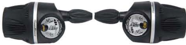
TSM53 R8/L3/LF [Cyclop Display] [Alloy C-Clamp]