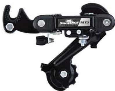
RDM15 LD/LB SD/SB [5-Speed] [Index Cable Adj.]