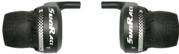
TSM10 RF/LF [Light Action Shift-Dual Ways] [TPR Grip] [Friction]