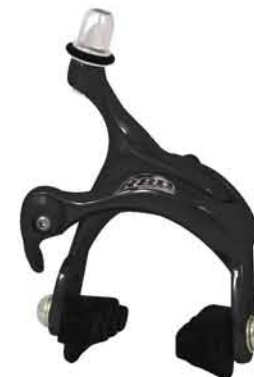
BCR81 F/R [Quick-Release] [Alloy Caliper]