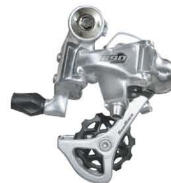
RDR90 SD/LD [Alloy Links] [9-Speed]