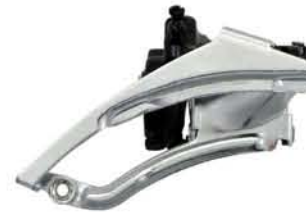
FDM67 LD/MD/SD [42-32-22T] [Alloy Clamp] [Dual Pull]