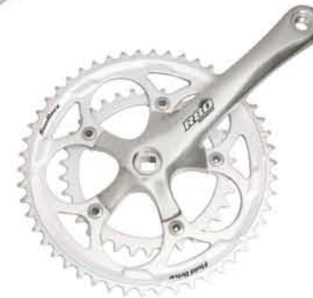
FCR86 50-34T [6061 Forged Alloy Crank] [SCM435 Bolts & Nuts]