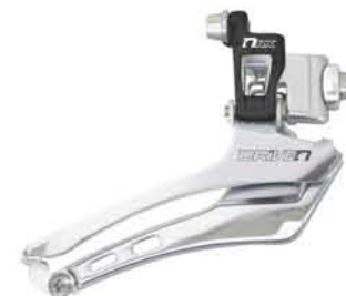
FDRX BB [56~50T Double] [Forged Alloy Links] [99g]