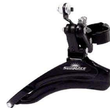
FDM2B [48-38-28T] FDM2C [42-34-24T] SB/ST/MB/MT [Friction]