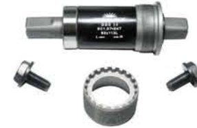
BBS15 BSN [BC-68/122mm]