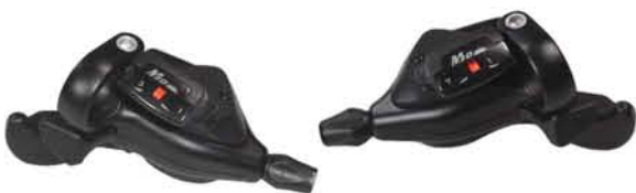
DLM33 R8/R7/L3 [Composite Shift Levers]