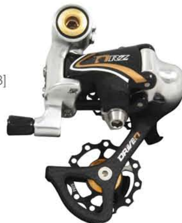
RDRZ1 SD [Carbon Reinforced Link] [Carbon Cage] [Carbon Cable Adj.] [7075 Pulleys] [Sealed Cartridge Bearings] [7075 Bracket Bolt] [10 & 9-Speed] [187g]