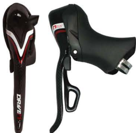
STRZ RT/L2 [Carbon Reinforced Brake Lever] [7075 Forged Alloy Up-Shift Lever] [Teflon Coated Cable] [383g/pair]