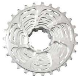
CSRZ TAO 11-23T TBO 12-23T TBQ 12-25T