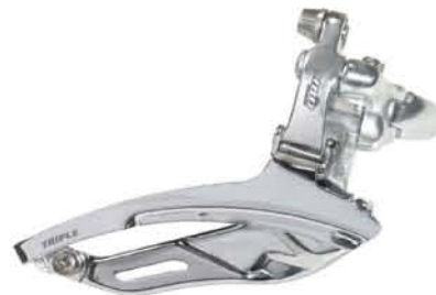
FDR87 BB/MB/SB [52T Triple] [Forged Alloy Links]