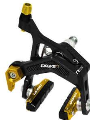
BCRZ F/R [Quick-Release] [CNC Alloy Caliper] [Titanium Hardware] [Cartridge Brake Shoe Pads] [Convex Washer Adj. Shoes] [281g/pair]