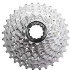
CSMX5 / CSM96

n New entry 10spd chains featuring chromized pins in [S]Silver Nickel or [Y]Gray Finish.