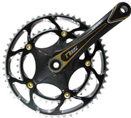
FCRZ6 [D1] 50-34T FCRZ1 [D1] 53-39T Z7 [D1] 50-36T Z3 [D1] 52-39T [BCD 110mm] [BCD 130mm] [Carbon Crank] [Titanium Axle] [7075 Chainrings] [7075 Bolts & Nuts] [7075 Axle Bolt] [702~722g incl. BB]