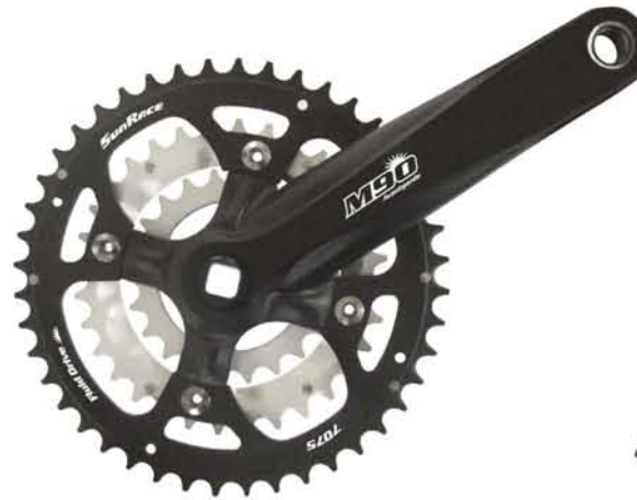
FCM9A [7075 44T] FCM9B 44-32-22T [Square Taper]