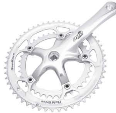
FCR81 53-39T FCR83 52-42T FCR87 52-42-30T [6061 Forged Alloy Crank] [SCM435 Bolts & Nuts]

Brazed on: R8/LF B[28.6mm] C[44mm] Clamp: 8F H[22.2mm] G[25.4mm] D[28.6mm]