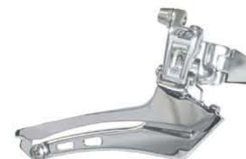
FDRS0 BB/LB/MB [56~50T Double] [Forged Alloy Links] [99g]