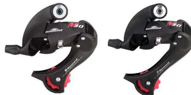
RDM36 SD/SB [6-Speed] [Index Cable Adj.]