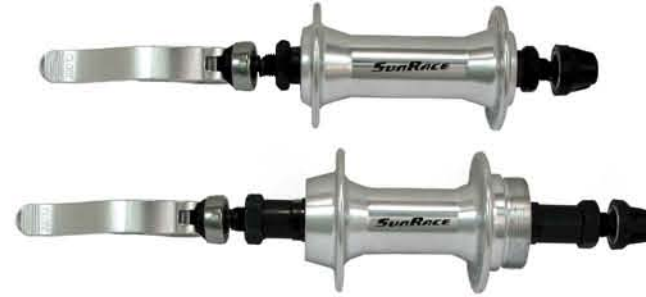
HBM45 F/R8/R7 [QR or Nuted Type]