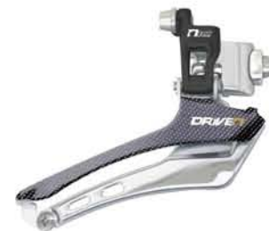
FDRZ BB [56~50T Double] [Carbon Reinforced Cage] [Forged Alloy Links] [102g]