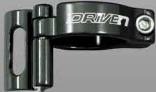
SPFDC.A01L.BD0 [ø34.9] SPFDC.A01M.BD0 [ø31.8] SPFDC.A01S.BD0 [ø28.6]

End Grip - TPR [Open 80mm] [Closed 86mm]