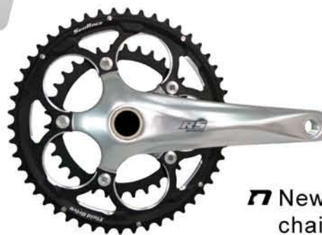
F CRS / FCR9A, 9F

n New improved outer chainring with CNC accents.