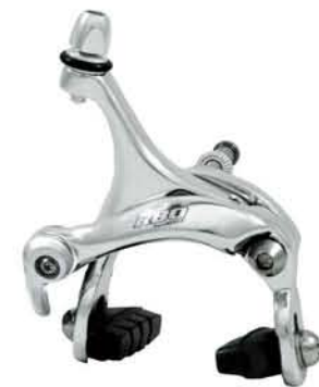
BCR80 F/R [Quick-Release] [Forged Alloy Caliper]