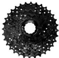
CSMX7 / CSM96 / CSM66

n New 9spd 11-28T ratio cassettes in MX5 and M96 model levels.