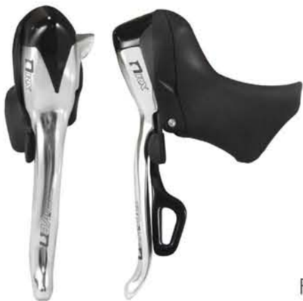
STRX RT/L2 [Forged Alloy Brake Lever] [7075 Forged Alloy Up-Shift Lever] [Teflon Coated Cable] [387g]