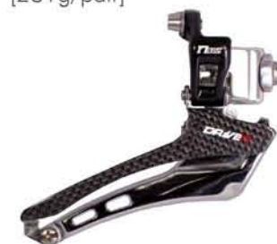
FDRZ BB [56~50T Double] [Carbon Reinforced Cage] [Forged Alloy Links] [102g]