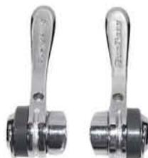
SLR90 R9/LF B[28.6mm] C[44mm]