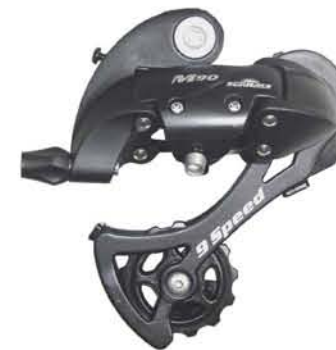
RDM90 LD [Alloy Outer Link] [13T Tension Pulley]