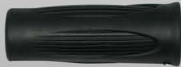
GPM50 O [Open]/C [Closed]

Bolt & Nut Set for Chainrings [7075 Alloy]